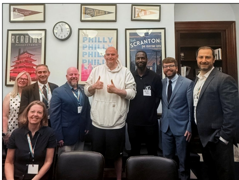
Trust for Public Land, Senator Fetterman