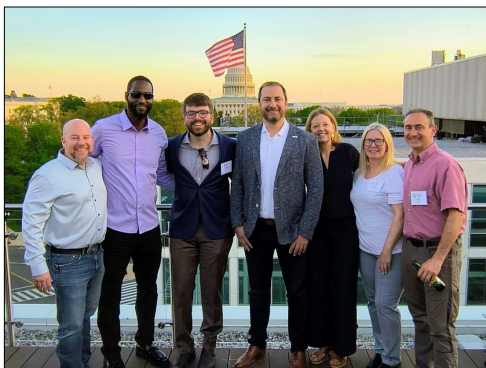
Trust for Public Land, Team PA

LWCF has leveraged 46,000 projects since its inception in 1965 to create and preserve outdoor recreational opportunities. The outdoor recreation economy is a $1.1 trillion economy and one of Pennsylvania's fastest growing industries, generating $20.4 billion in 2024.