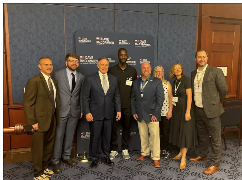
Trust for Public Land, Senator McCormick